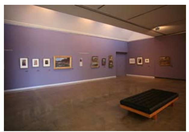
Exhibition: Ten Iconic Masters

Selections from the Hinton Coventry and NERAM Collections were shown year around. Guest curators from the Art Gallery of NSW curated specific permanent collection exhibitions.