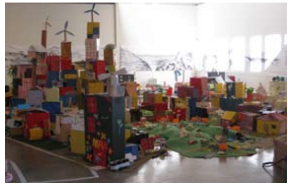
Exhibition: My Places, Cities and Towns

Thetwocommunityparticipatoryeventsincluded My Places, Cities and Towns, a community collaborative installation which created a sustainable city from cardboard boxes and The Artist Studio where the gallery came alive with regional artists working in the gallery space giving the visiting public a unique insight into the practice of working artists.