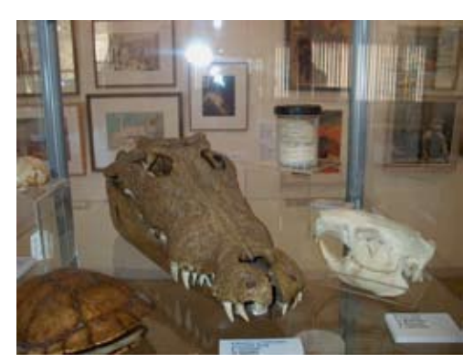
Exhibition: Penguin Gizzards and More! UNE Collections

A partnership with the University of New England, saw an exhibition comprised of objects from the university collections entitled: Penguin Gizzards and More! UNE Collections .