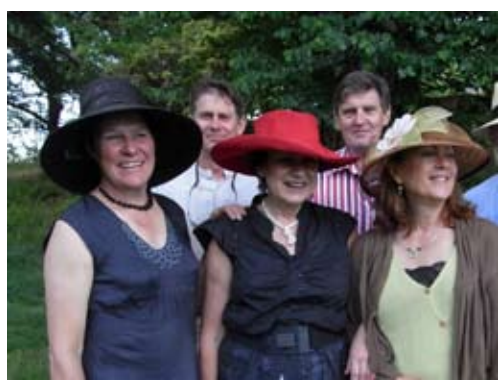
Friends of NERAM Committee

11.1. Friends of NERAM have been particularly supportive of the Art Museum. Since January 2009, they have been catering at all exhibition openings. They also sponsored two major projects this year: