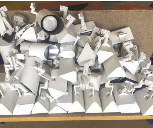
Old incandescent light fittings replaced by energy efficient LED lights