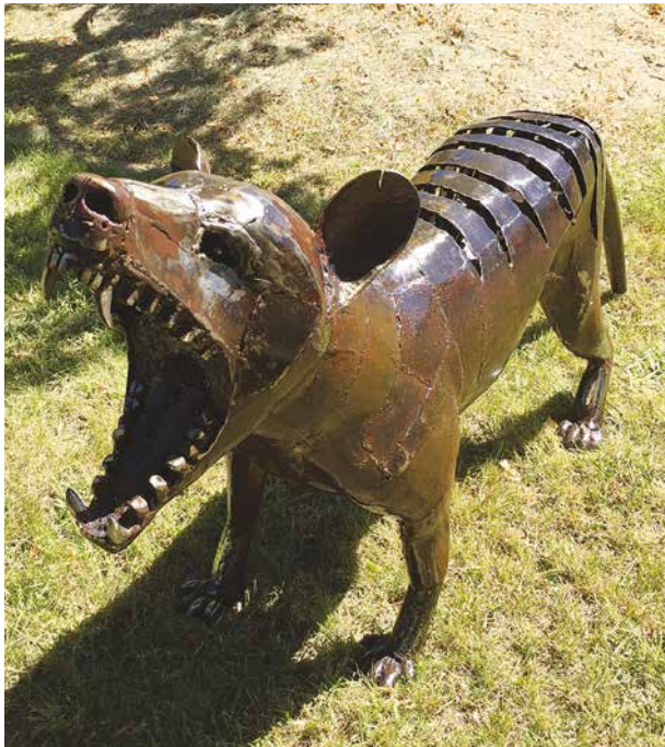
Sculpture at NERAMble 2016