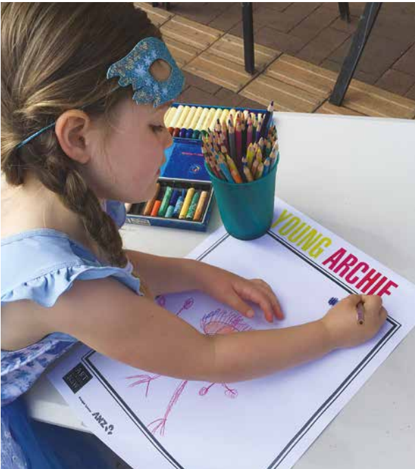
Young Archie activity in Beardy Street Mall, 2015