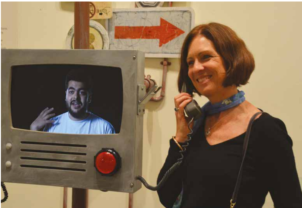
Shaun Tan's The Lost Thing: from Book to film 2016