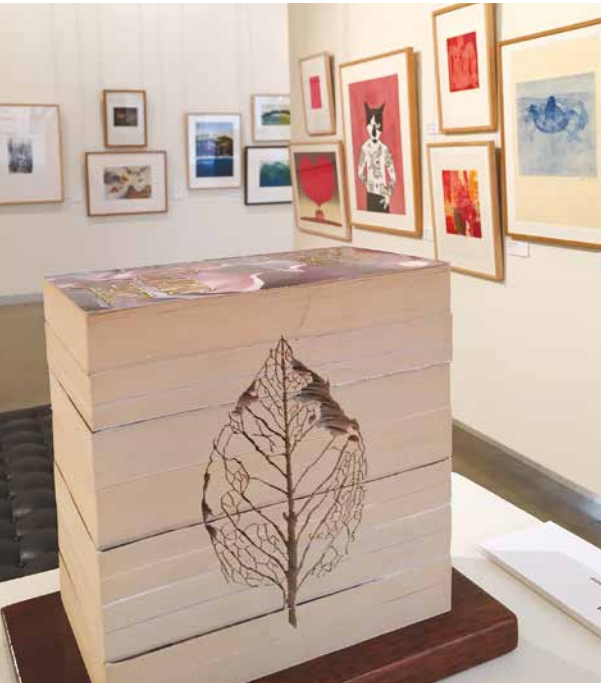
2015 Packsaddle exhibition

24th June Exhibition Opening (130 people) Views of Landscape BE: Home I=PC2