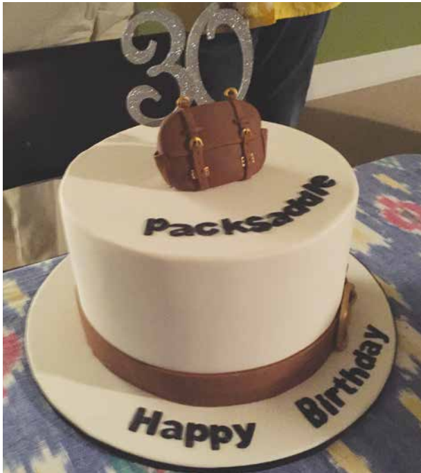
30th Packsaddle exhibition