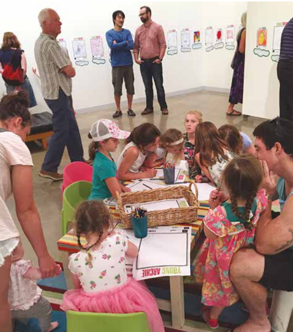
Young Archies project 2016