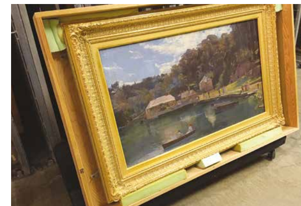
Tom Roberts Mosman's Bay travelled to Canberra