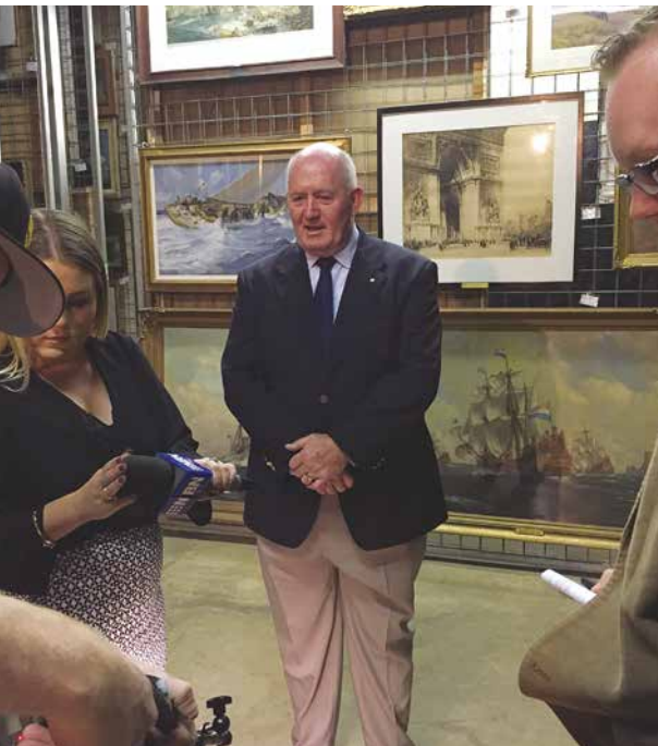
His Excellency General the Honourable Sir Peter Cosgrove AK MC (Retd) Governor General of the Commonwealth of Australia at NERAM

The Margaret Olley Trust continued its partnership with NERAM, donating $112,000 to assist with staffing infrastructure and salaries