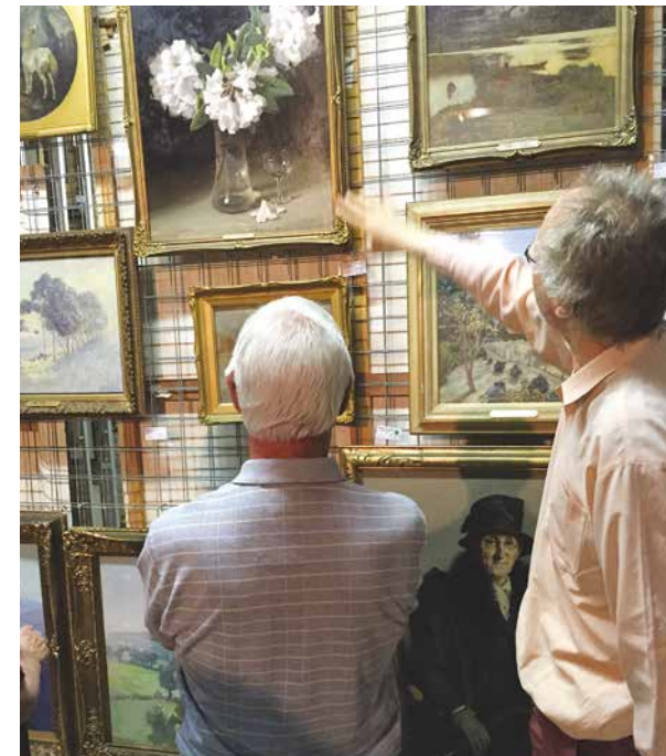
Visiting the Art Store at NERAM