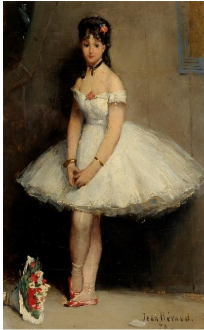
Jean Beraud (1849-1936) La Danseuse 1873 oil on wood