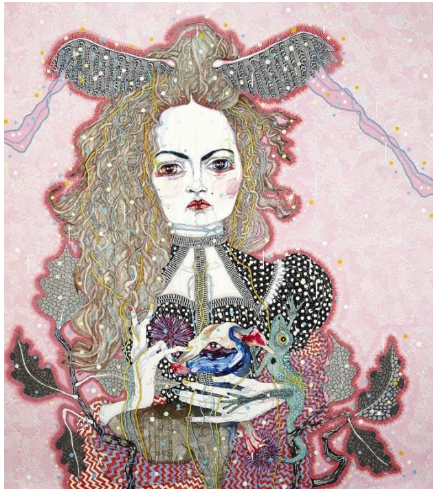
Del Kathryn Barton The Daughter (detail) 2011-12 Acrylic, gouache, watercolour and ink on polyester canvas

Here are some portraits currently hanging in the art museum for inspiration.