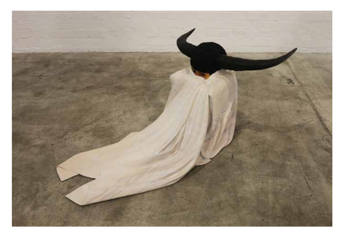
Abdul-Rahman Abdullah The boy who couldn't sleep 2017 Painted wood, buffalo horn 56 x 127 x 74 cm