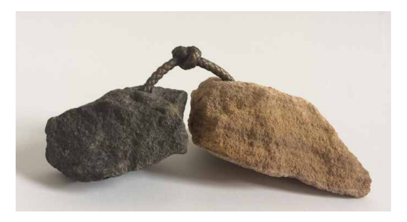
Will French Knot set in stone 2014 Bronze cast rope, sandstone, bluestone 9 x 30 x 9 cm