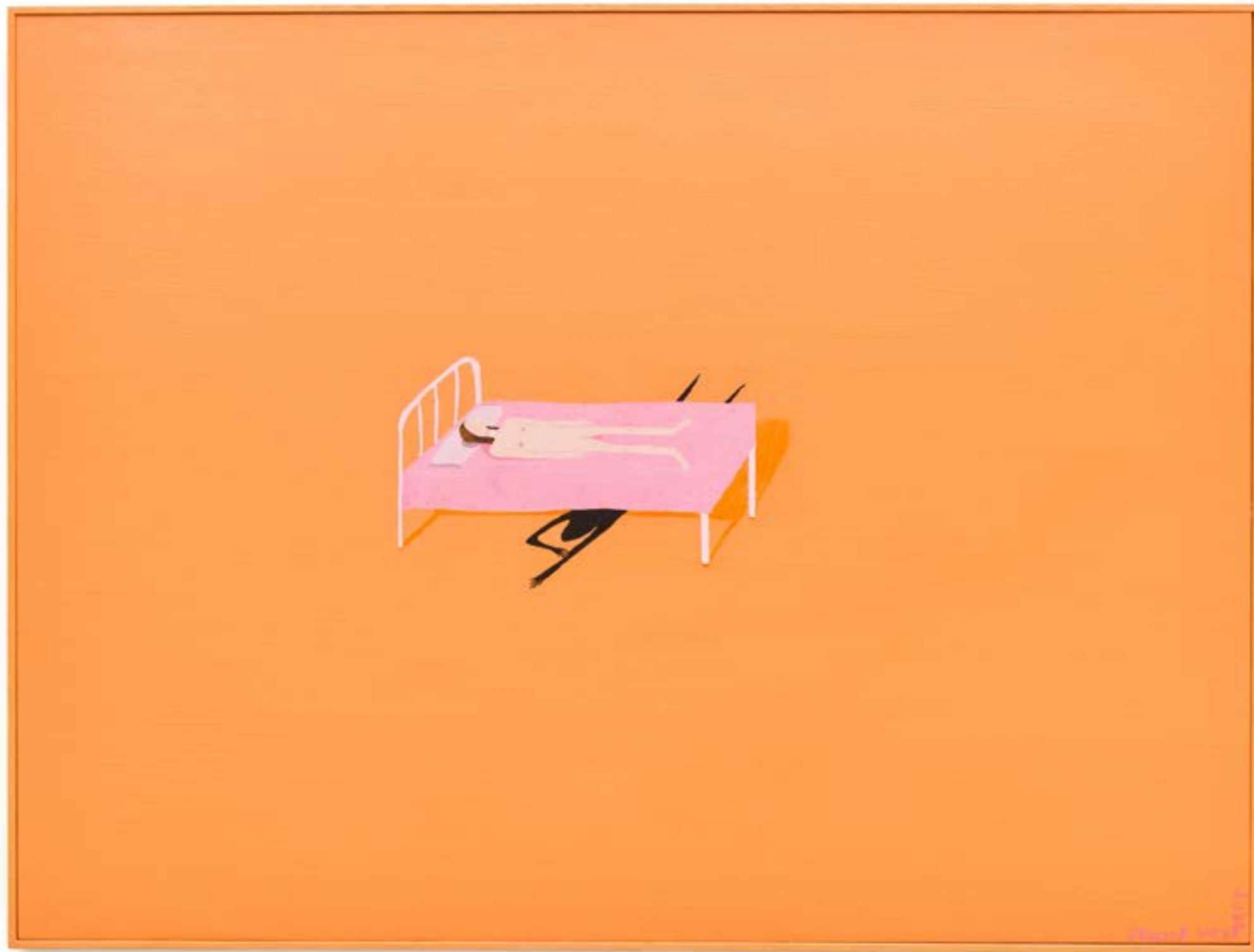
Boogeyman 2024 Oil paint and synthetic polymer paint on timber panel. Artist made frame. 62 x 82 cm $950 Framed