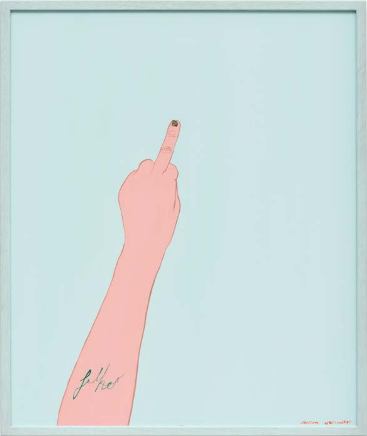
Glitter Nail 2024 Oil paint and synthetic polymer paint on canvas. Artist made frame. 56 x 47 cm $750 Framed