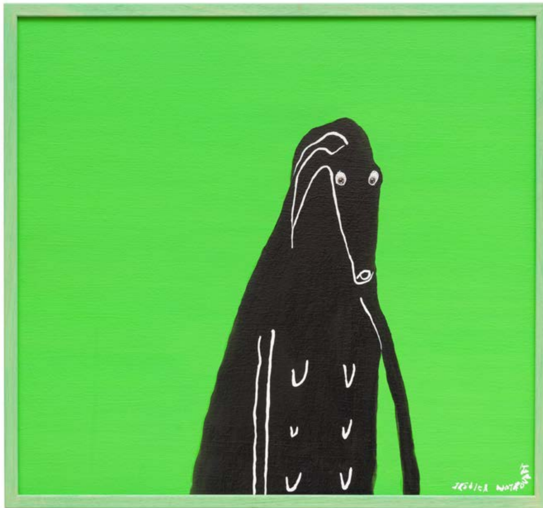
Preggo Bitch 2024 Oil paint and synthetic polymer paint on canvas. Artist made frame. 48.5 x 52 cm $750 Framed