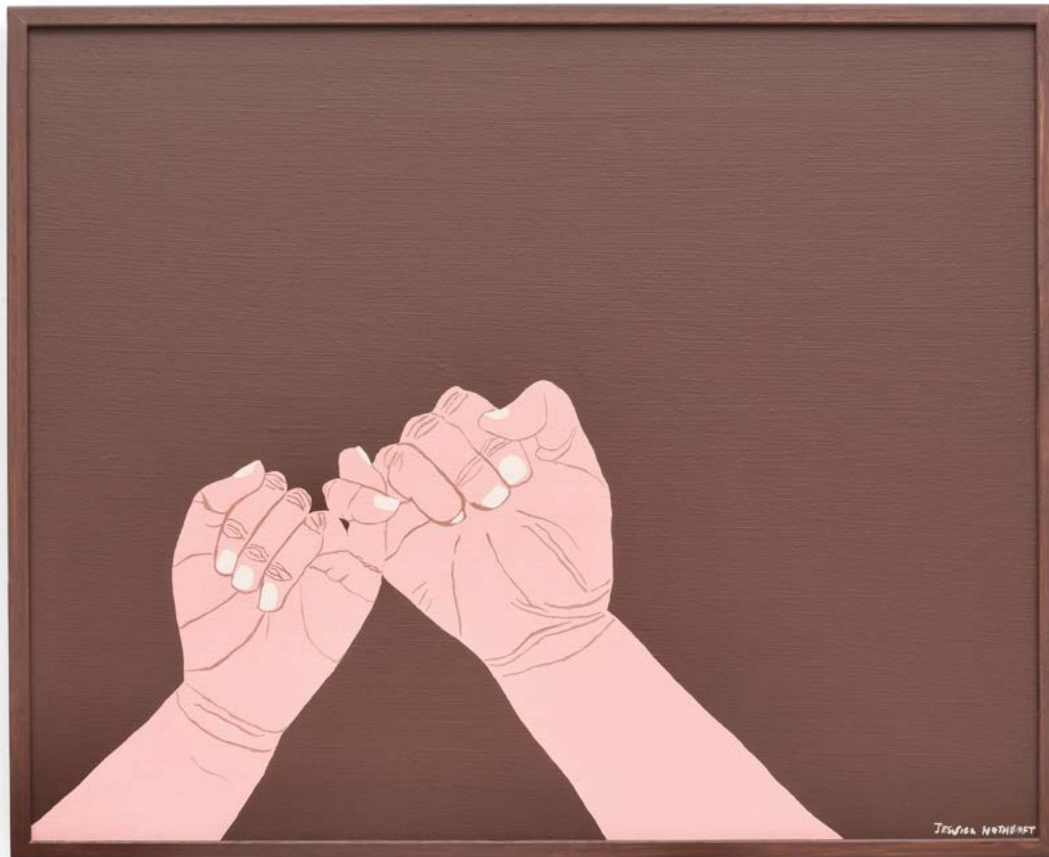
The Promise 2024 Oil paint and synthetic polymer paint on canvas. Artist made frame. 54 x 66 cm $750 Framed