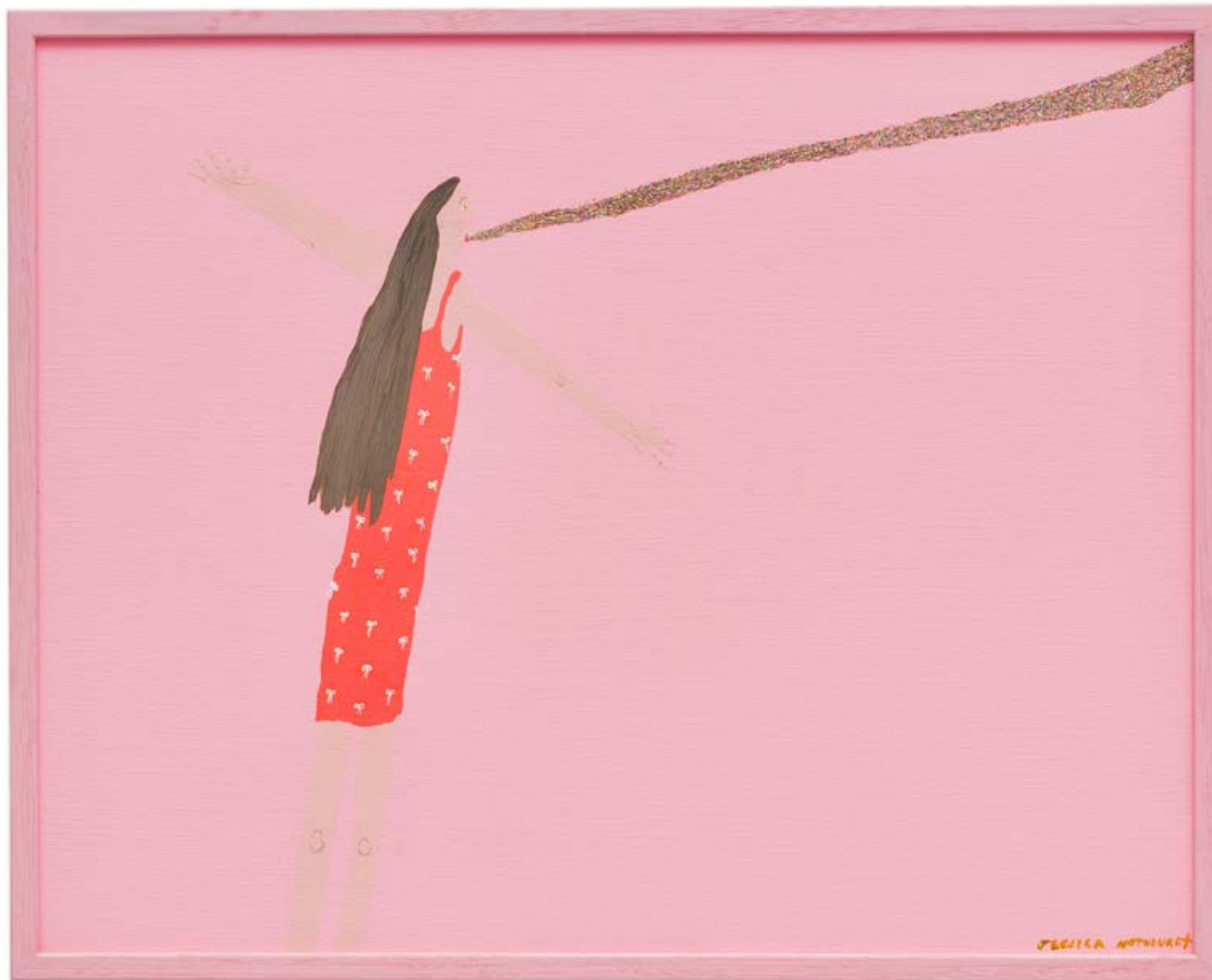
Purge 2024 Oil paint, synthetic polymer paint and reflective particles on canvas. Artist made frame. 45 x 56 cm $750 Framed