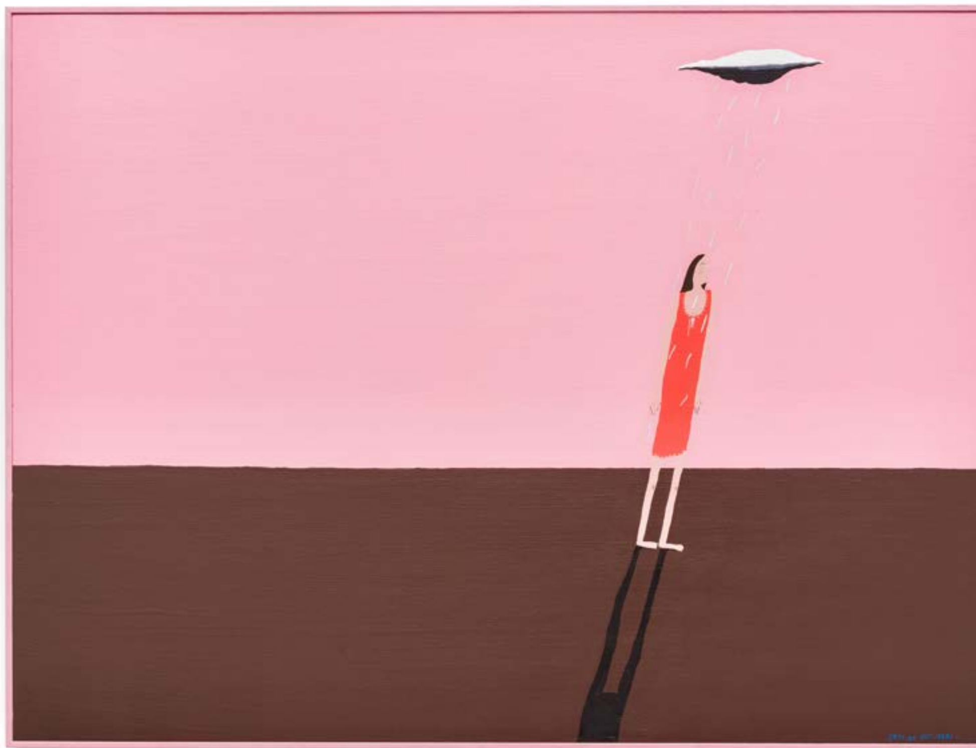
The years are plenty 2024 Oil paint and synthetic polymer paint on timber panel. Artist made frame. 62 x 82 cm $950 Framed