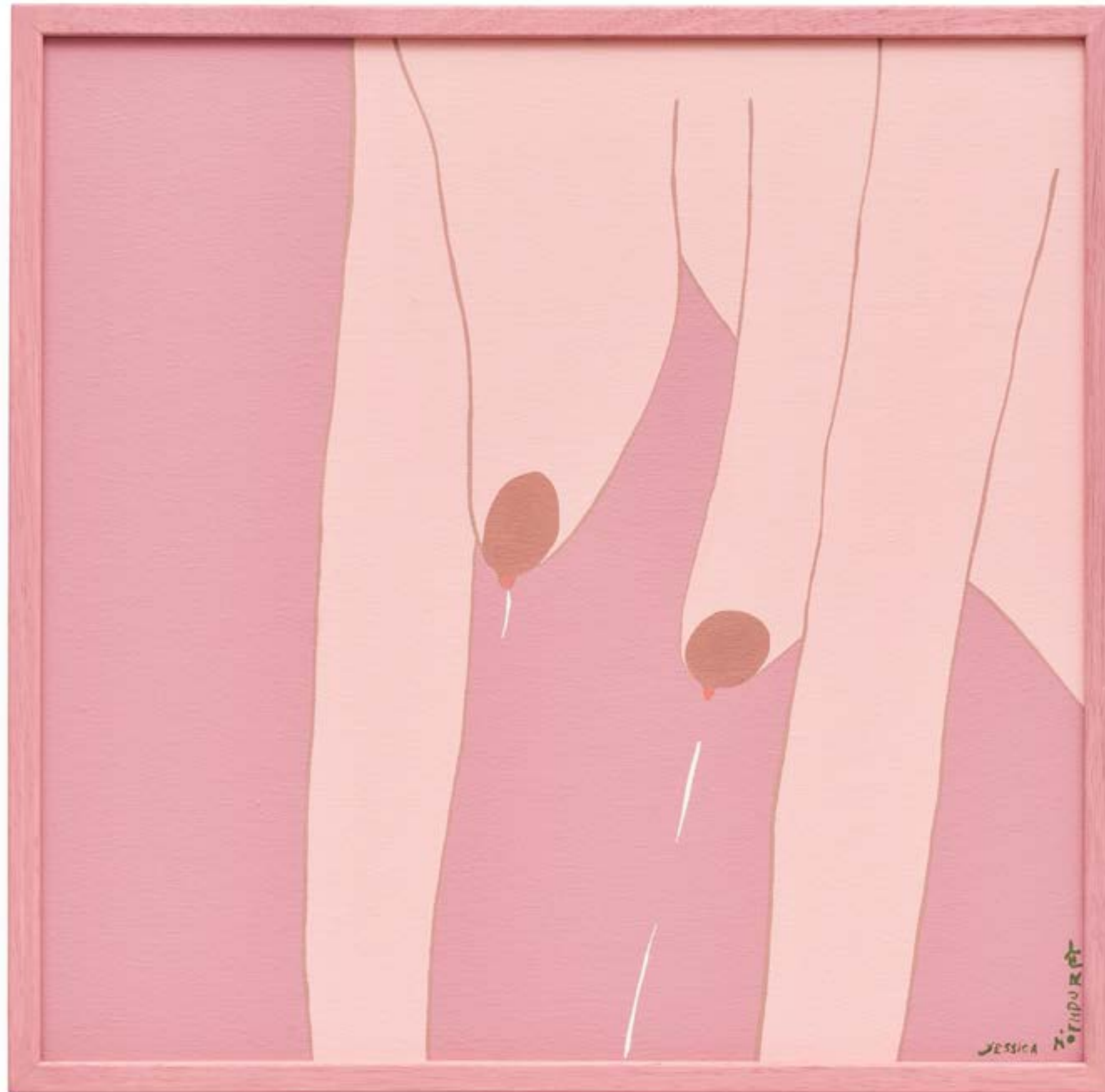
Leaking Tits 2024 Oil paint and synthetic polymer paint on canvas. Artist made frame. 44 x 45 cm $750 Framed