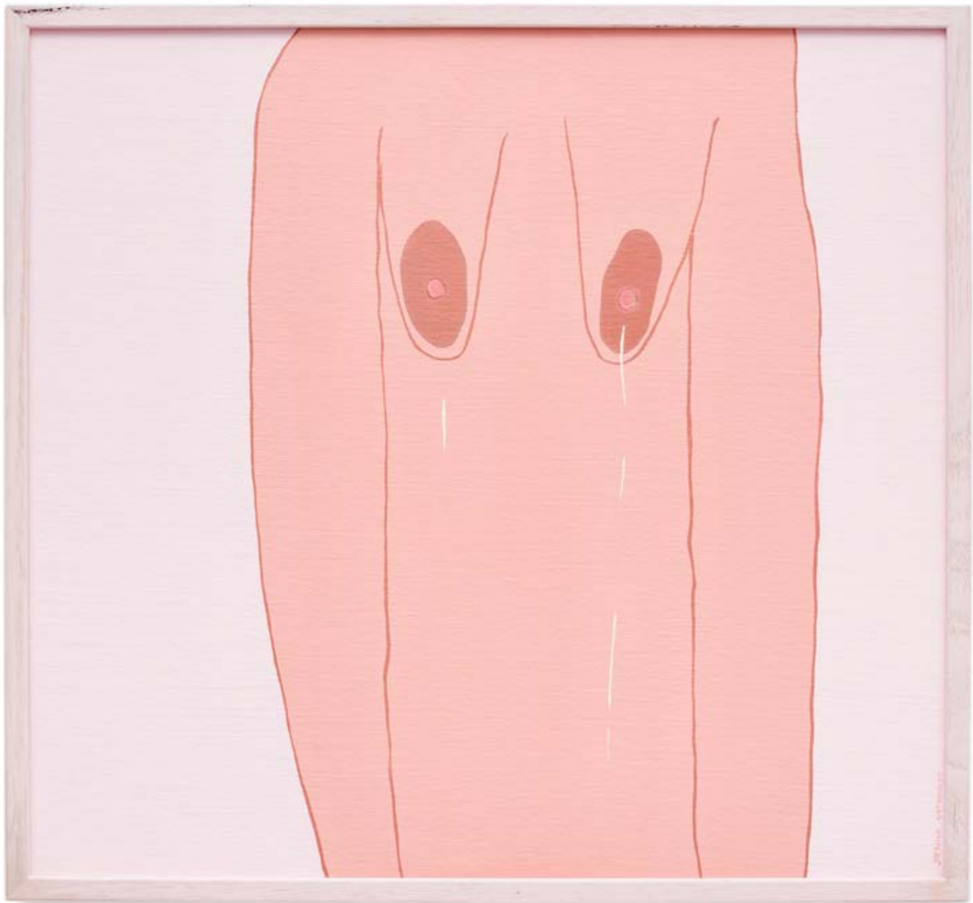
Sore Tits 2024 Oil paint and synthetic polymer paint on canvas. Artist made frame. 51 x 57.5 cm $750 Framed