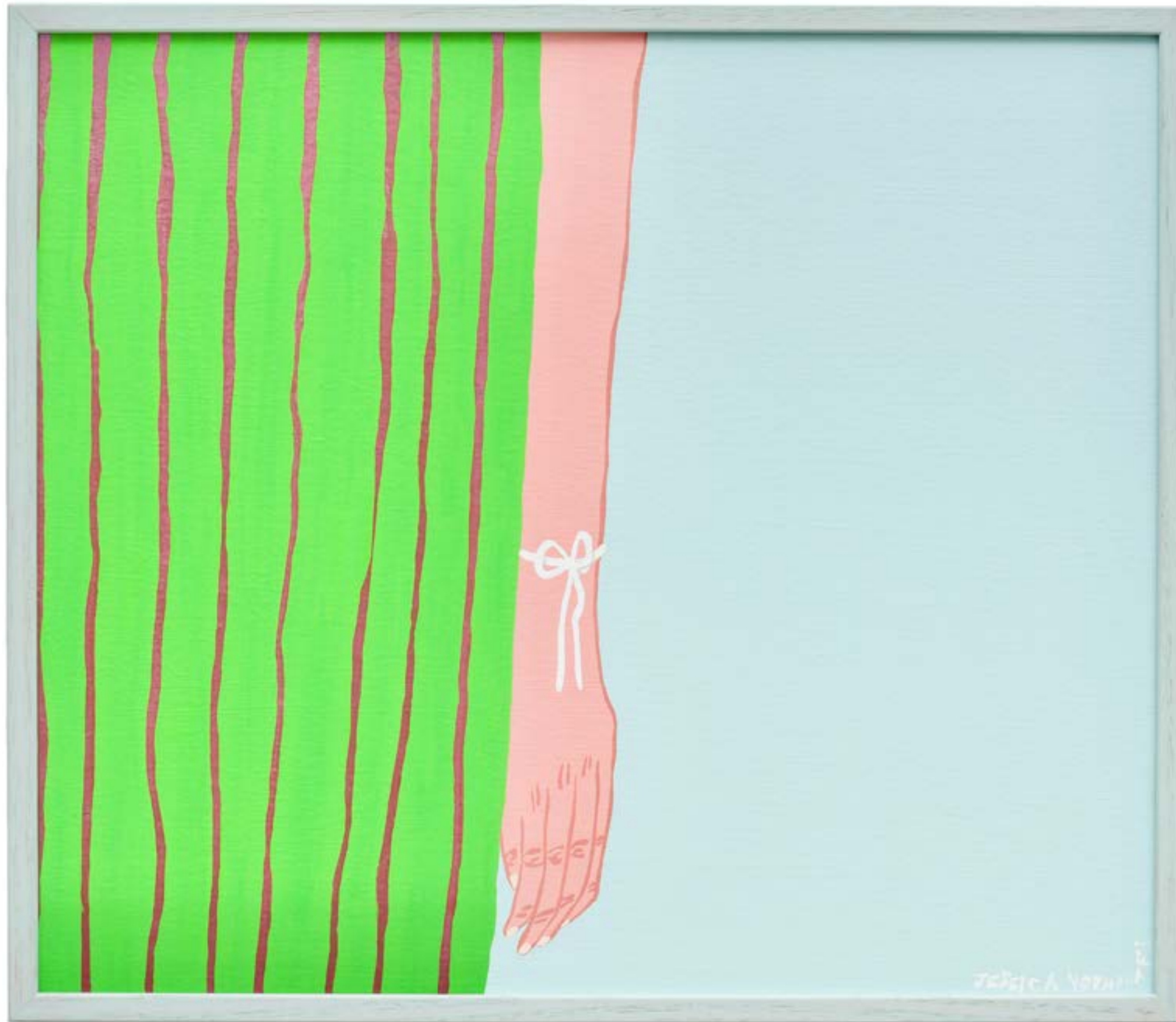
White Ribbon 2024 oil paint, synthetic polymer paint and powdered pigment on canvas. Artist made frame. 45 x 52 cm $750 Framed