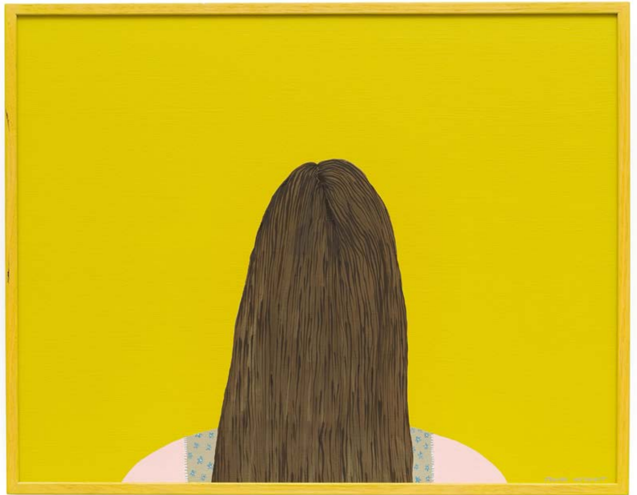
Portrait from the Back 2024 Oil paint and synthetic polymer paint on canvas. Artist made frame. 52 x 66 cm $750 Framed