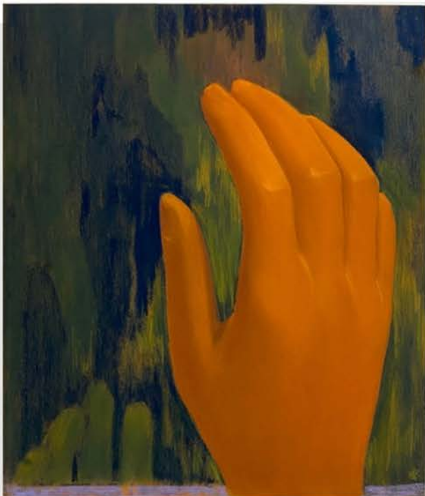
There you are soft pastel on Canson Mi Tienes Velvet paper | 37.7cm x 32.5cm $600 (framed)