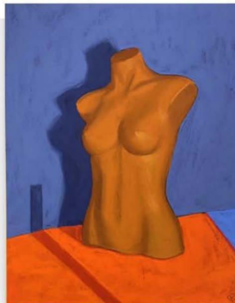
Still standing soft pastel on Canson Mi Tienes Velvet paper | 29cm x 22.7cm $500 (framed)