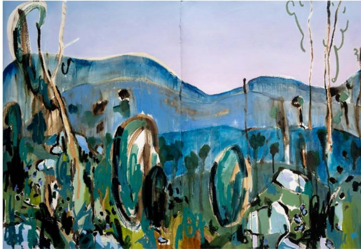
At the edge of enough Bitumen and oils on paper | 76 x 110cm $1800 (framed)