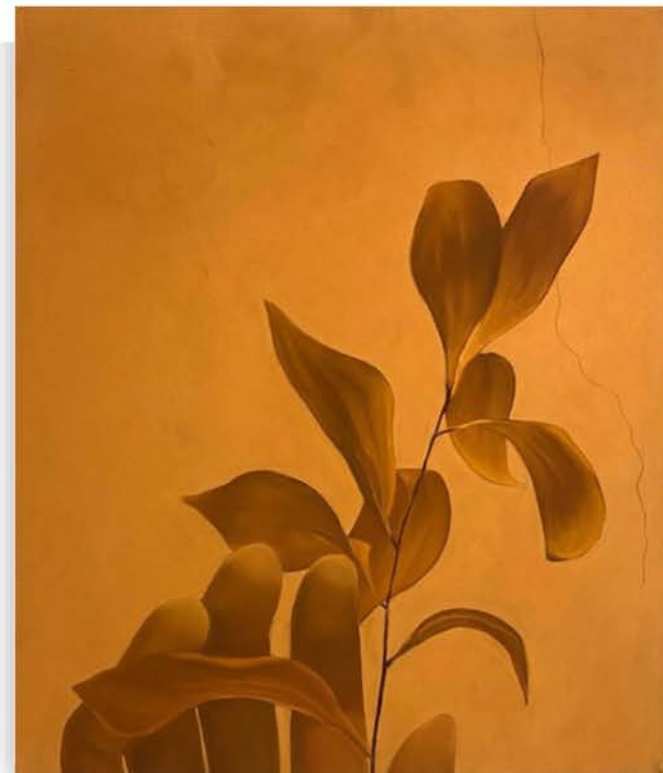
Thinking of saying bye soft pastel on Canson Mi Tienes Velvet paper | 58.7cm x 50.3cm $1200 (framed)