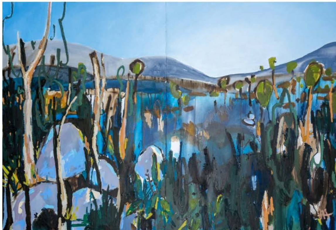
Out of the blue Bitumen and oils on paper | 76 x 110cm $1800 (framed)