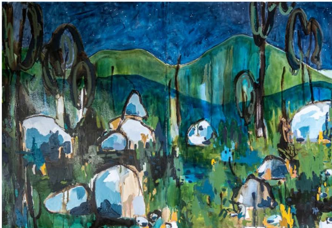
A light that never goes out Bitumen and oils on paper | 76 x 110cm $1800 (framed)