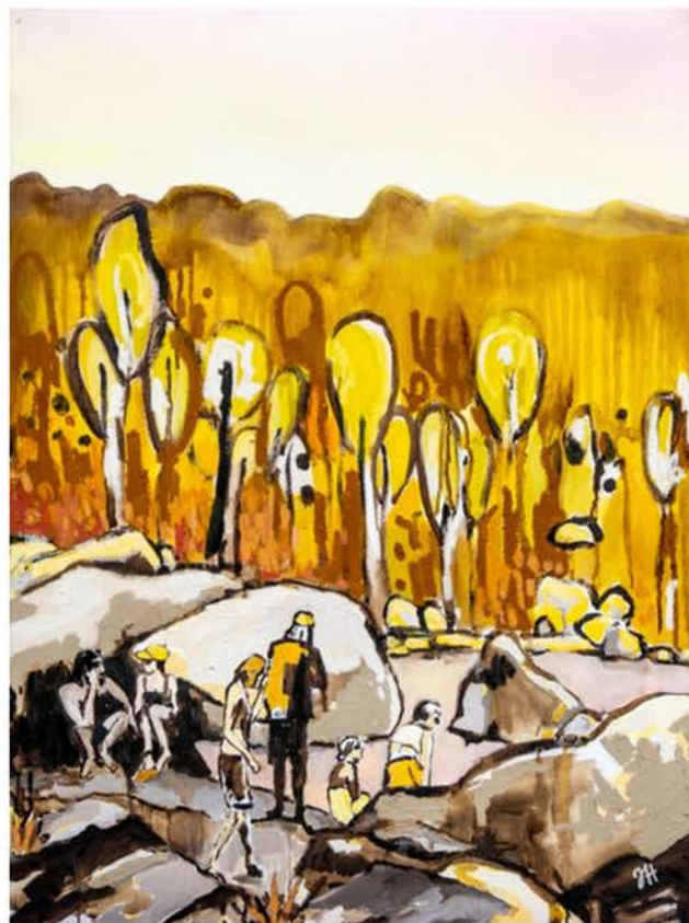
Gara Gorge in yellow Bitumen and oils on paper | 76 x 56cm $1100 (framed)