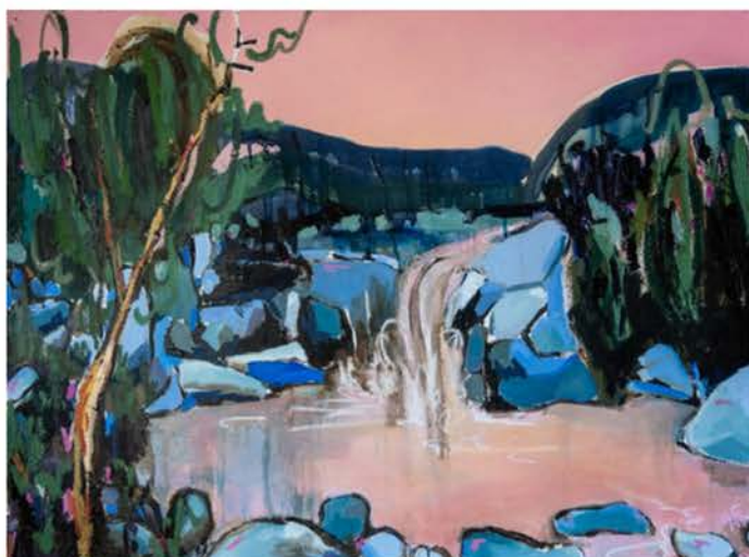
Something was held Bitumen and oils on paper | 56 x 76cm $1100 (framed)