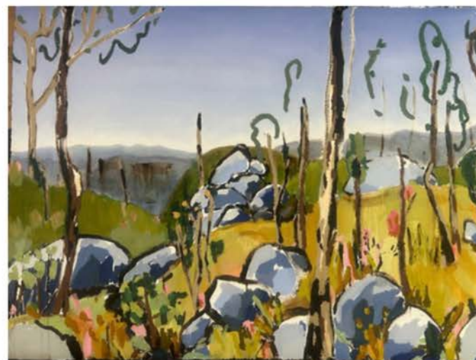
I belong to the ground Bitumen and oils on paper | 56 x 76cm $1100 (framed)