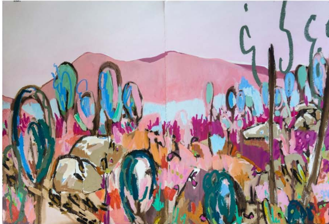
Made of the sun Bitumen and oils on paper | 76 x 110cm $1800 (framed)