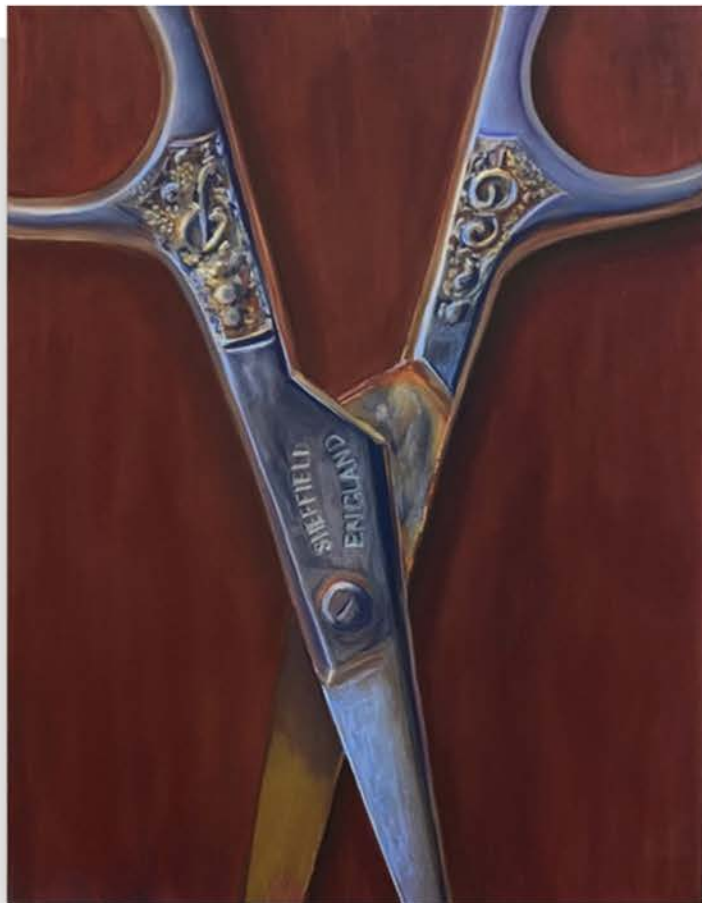
Cutting soft pastel on Canson Mi Tienes Velvet paper | 65cm x 50.2cm $1290 (framed)