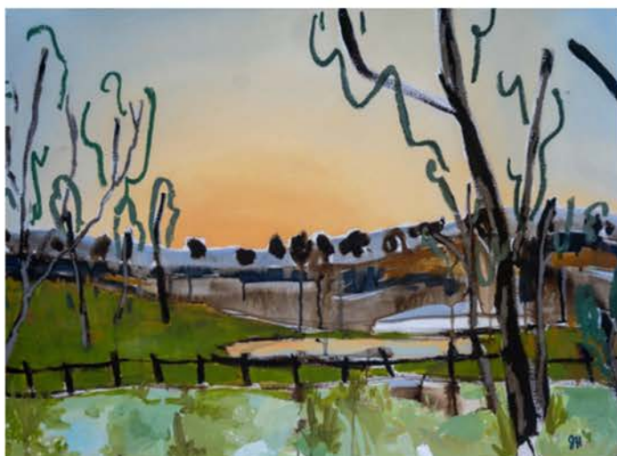
Fade into you Bitumen and oils on paper | 56 x 76cm $1100 (framed)