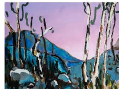
The light stayed Bitumen and oils on paper | 31 x 41 cm $390 (framed)