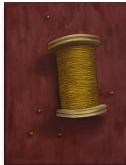
Embellishments soft pastel on Canson Mi Tienes Velvet paper | 32.2cm x 25.1cm $500 (framed)