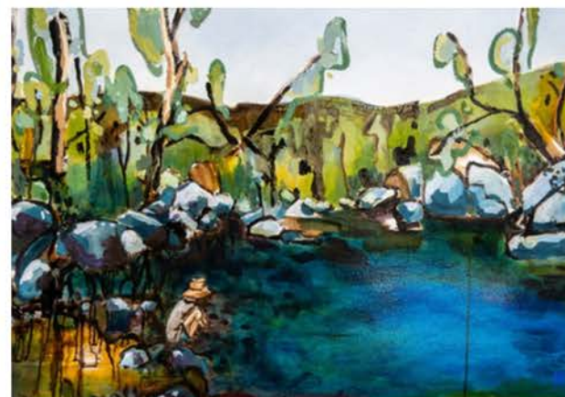
In my own world Bitumen and oils on paper | 48 x 68cm $750 (framed)