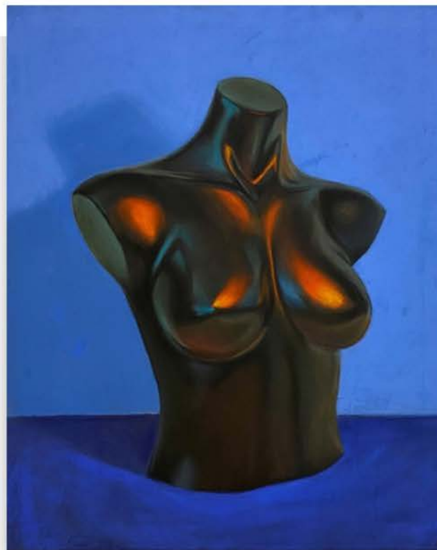
Still in the moment soft pastel on Canson Mi Tienes Velvet paper | 56.8cm x 46.2cm $1200 (framed)