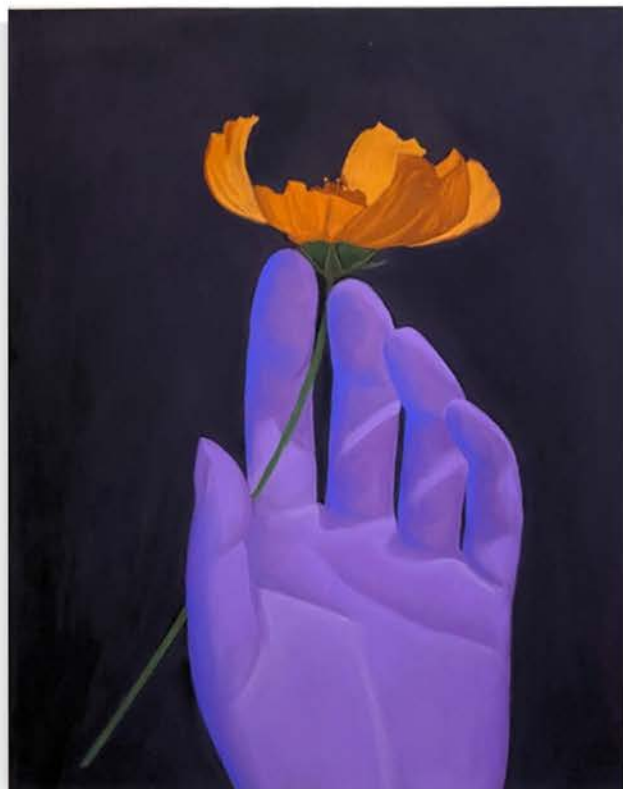
A small peace soft pastel on Canson Mi Tienes Velvet paper | 63.5cm x 50.3cm $1290 (framed)