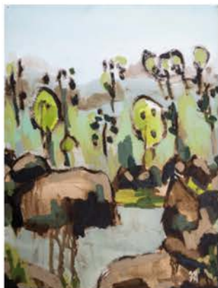
A quiet between Bitumen and oils on paper | 41 x 31 cm $390 (framed)