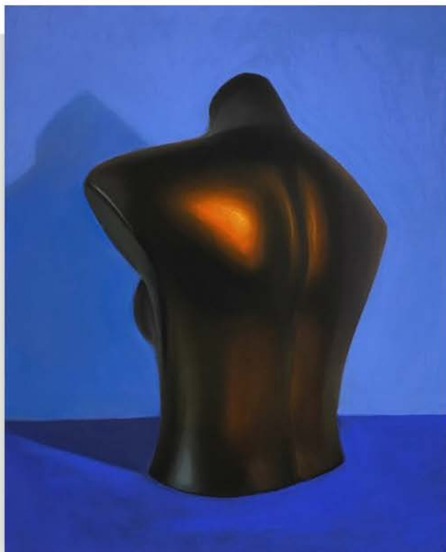
No soft pastel on Canson Mi Tienes Velvet paper | 56.8cm x 46.2cm $1200 (framed)