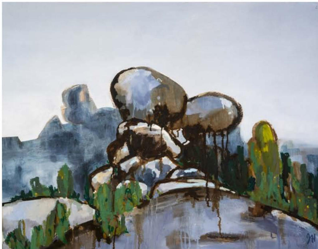
Cathedral Rock / Breath became thought Bitumen and oils on paper | 54 x 68cm $900 (framed)