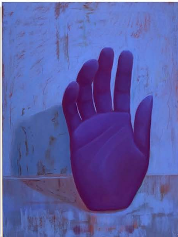
Thinking of saying hi soft pastel on Canson Mi Tienes Velvet paper | 61.6cm x 46.2cm $1250 (framed)