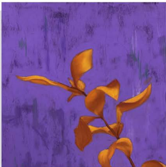
It's so nice to see you again soft pastel on Canson Mi Tienes Velvet paper | 31cm x 31cm $600 (framed)