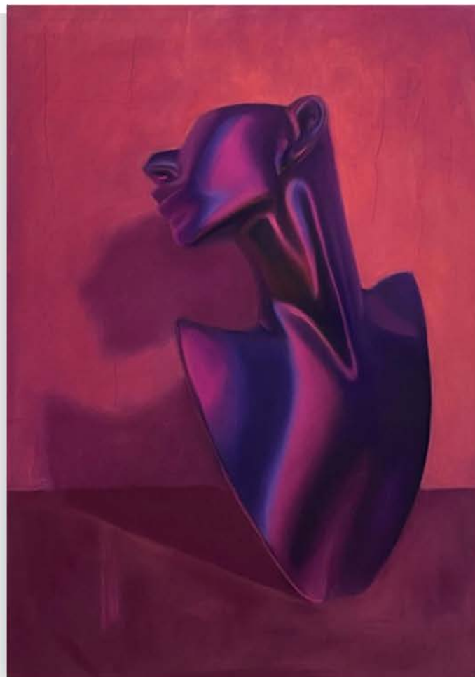
I'll wait for you soft pastel on Canson Mi Tienes Velvet paper | 57.5cm x 41cm $1200 (framed)