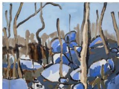
Between here and gone Bitumen and oils on paper | 31 x 41 cm $390 (framed)